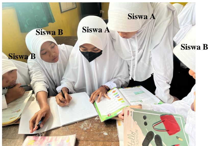
Figure 1. Student discussion solving mathematical problems

When someone has a high level of intrapersonal skills and interpersonal skills, it means they are not only able to understand and manage themselves well, but can also relate to other people effectively. The ability to carry oneself well in social relationships, work collaboratively in teams, and understand interpersonal dynamics can help individuals to succeed in various aspects of personal and professional life. High interpersonal skills are used by students to improve relationships with other people (Rose & Nicholl, 1997). These students become leaders or active social actors among their classmates. This can be seen in Figure 1 below which shows students contributing to group projects and facilitating collaboration.