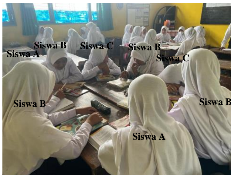
Figure 2. Students discussing while learning mathematics

Students who are at a moderate level of intrapersonal skills, students can identify their personal strengths and weaknesses quite well, manage their own time and emotions quite effectively, but students have difficulty communicating effectively with other people. They lack self-confidence or uncertainty in social interactions, have difficulty working together in groups or teams, because they have difficulty understanding and adapting to social dynamics. They tend to prefer to work alone or have their own time, and are less active in social activities. This can be seen in Figure 3, the student's body posture shows inactivity, where they sit in an attitude that shows a lack of involvement, facial expressions show helplessness or discomfort and do not show a strong emotional reaction to the topic being discussed.