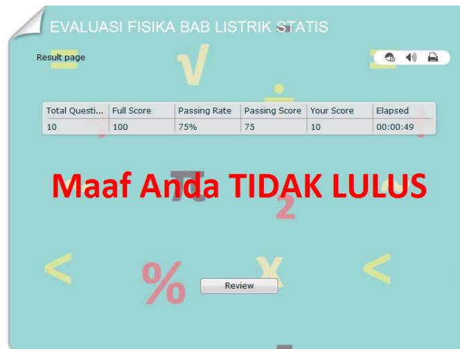
Picture 4. Student’s score that not completeness