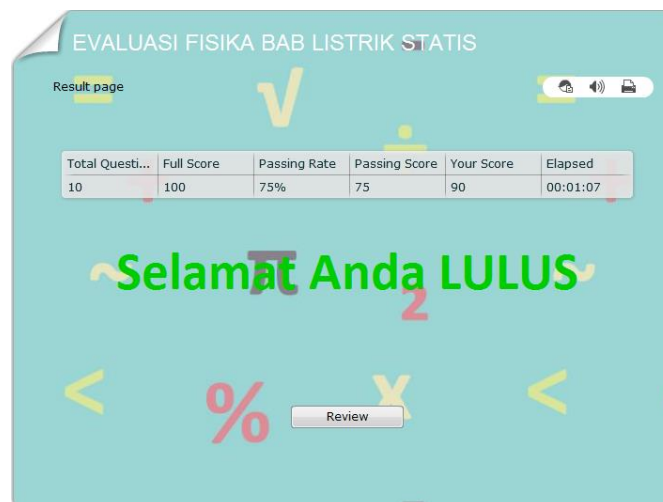
Picture 3. Student's score that completeness

Completeness of students can be seen in Table 5 above. Based on data that has been obtained, it is known that the number of students who get a value of 10 is 5 people, a value of 20 is 1 person, a value of 30 is 10 people, a value of 40 is 7 people, a value of 50 is 3 people, a value of 60 is 2 people, a score of 60 is 70 as many as 2 people, a score of 80 as many as 3 people, a score of 90 as many as 2 people, and no student who got a score of 100. Completeness of students can be seen in the table that students who did not pass were 30 people, while those who passed only only 5 people. This following are some of the scores obtained by students.