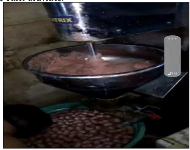
Figure 3. The Making Process of "SIP Meatballs"

Process innovation, innovation in introducing processes in making products by conducting new production or production activities in a different way than before. Process innovation describes changes in the way companies produce products with modern technology and in making this process does not take time so as to save energy, in this case the owner of "Bakso SIP" has made changes. "SIP meatballs" in the process of making pentolnya with the use of meatball making machine tools with this provides more efficient time and can do other activities.