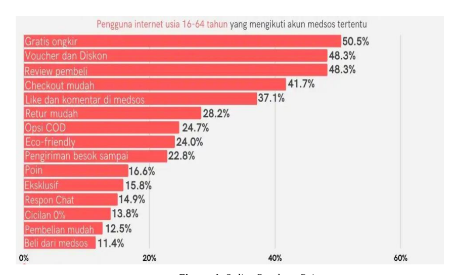
Figure 1 . Online Purchase Drivers

production to consumers. Entrepreneurs should pay attention to competitors and business trends so as not to lag behind competitors. Figure 1., the following is Indonesia's E-commerce Data 2022 in the Year of the Pandemic, Nurdian (2022) which shows the consumer's encouragement in making purchases online.