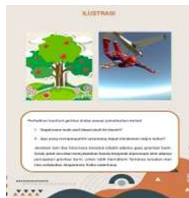
Figure 1. Problem identification

The most prominent indicator for measuring individuals who have high curiosity is the desire to explore information, the willingness to explore information, be adventurous with information and dare to ask questions. The four indicators of curiosity (Rahaja, Ronny Wibhawa, & Lukas, 2018) are: explorer, discover, adventurous, and questioning.