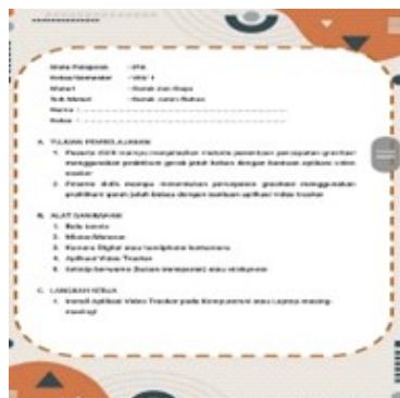
Figure 2. Data collection

motion around the students' environment. Students are expected to be able to identify given phenomena so that students recognize, propose and compare explanations for various natural and technological phenomena which demonstrate the skills to remember and apply appropriate scientific knowledge, make and justify appropriate predictions and offer hypotheses.