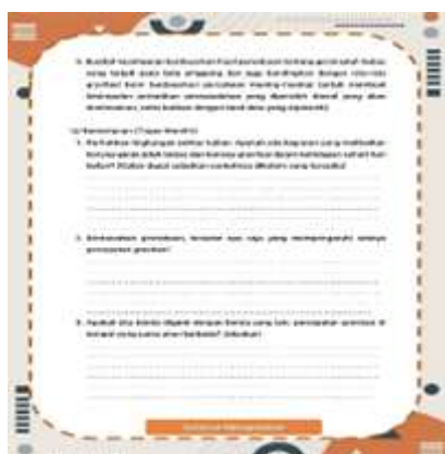
Figure 3. Argumentation part

Figure 2 students design experiments and propose ways to address scientific questions virtually. During this step, students work in collaborative groups to develop and implement methods to solve problems. The goal is to provide students with opportunities to interact directly with the material using data collection techniques, models and scientific theories. These types of strategies point students in productive directions and support them as they develop and implement investigations.