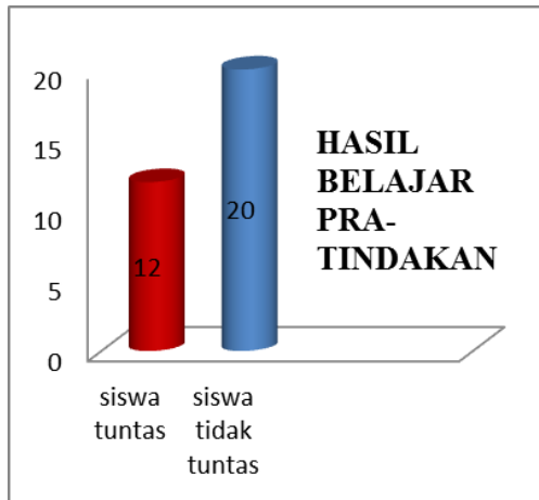
Figure 4.1 Graph of Acquisition of Social Studies Learning Outcomes