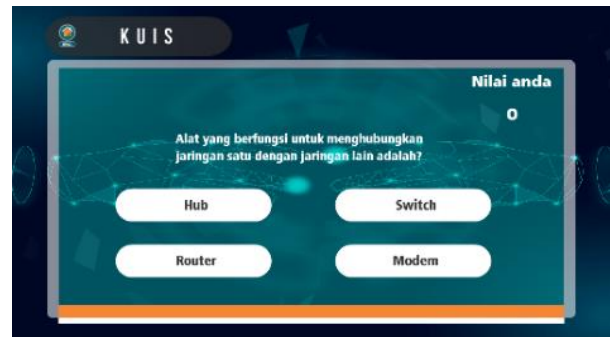
Figure 6. Quiz Scene Display

In the video scene the researcher includes a video tutorial on how to create a LAN using the Cisco Packet Tracer application downloaded from YouTube. This video is 8 minutes long. The quiz scene contains multiple choice questions with 4 answer choices. This question is in accordance with the material that has been given in the material and video scene. The answer is selected by clicking on one of the answers, then if it is correct, the value in the upper right corner will increase and then enter the next question. The questions and answers are arranged randomly, when the questions are finished a button will appear to repeat the quiz.