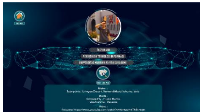
Figure 7. Profile Scene View

In the video scene the researcher includes a video tutorial on how to create a LAN using the Cisco Packet Tracer application downloaded from YouTube. This video is 8 minutes long. The quiz scene contains multiple choice questions with 4 answer choices. This question is in accordance with the material that has been given in the material and video scene. The answer is selected by clicking on one of the answers, then if it is correct, the value in the upper right corner will increase and then enter the next question. The questions and answers are arranged randomly, when the questions are finished a button will appear to repeat the quiz.