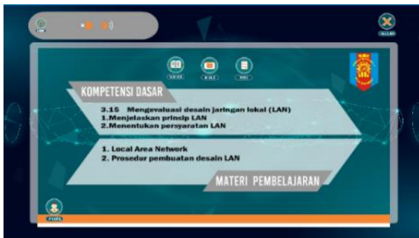
Figure 3. Scene Menu Display

Scene loading brings up the text of the name of the media, namely "Interactive Media for Computer and Basic Networks", then the loading animation is below the text that moves from left to right. The intro scene brings up 3D-like animation, a rotating circle and text that reads "Networking Multimedia Interactive". Then the media material titles and buttons began to appear sideways to the center.