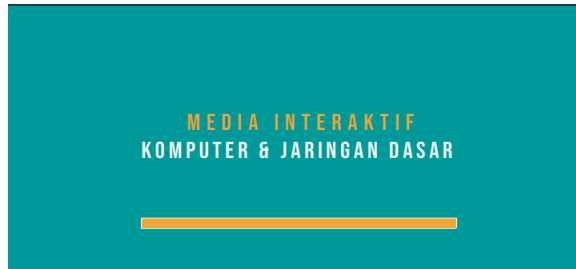
Figure 1. Scene Loading View

The products produced in this study are interactive learning media on Computer and Basic Network subjects that are made using the Corel Draw X7 application which is used to design the initial images that will be used as menu, button and animation backgrounds. Adobe Premiere Pro CC 2015 is used to produce video tutorials. Then the resulting images and videos are entered into the Adobe Animate Pro 2015 application to be used as interactive media consisting of 8 scenes, namely soading scenes, intros, menus, materials, videos, quizzes, assignments and profiles. The output file is published so that the resulting media is in the form of .exe which can be installed and operated on the desktop and then .apk which can be installed and operated on Android. The following is the initial appearance of the media developed before validation by experts.