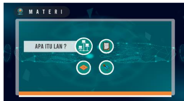
Figure 4. Material Scene View