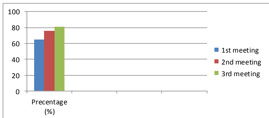
Graph 2 Increase of The Students' Activities in Teaching Learning Process Observed by Observer 1

Based on the data from observation, there was an increase of students' activities in the teaching learning process from the first till the third meeting. The increase of students' activities during three meetings can be presented in the following graph: